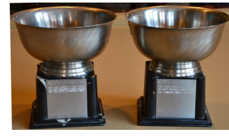
The illusive trophies—engraved with each year's winners.