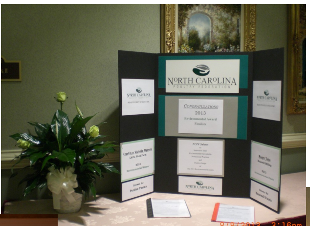
The Reception offers an ideal opportunity to network and visit with various industry professionals.