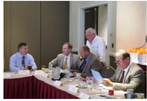
Board and guests at work.